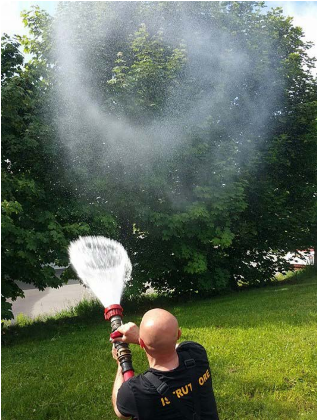
A POK hand nozzle showcasing pulsing.