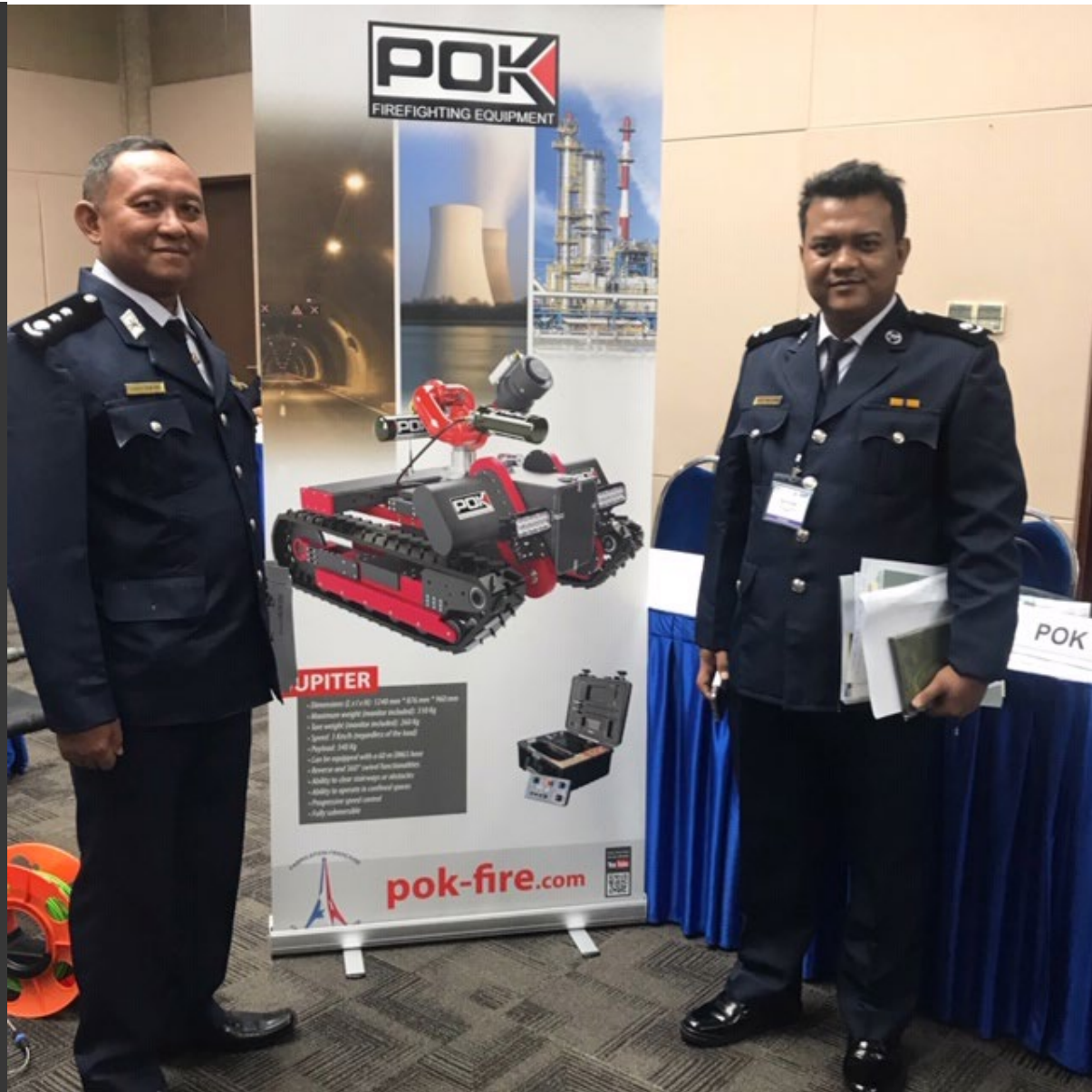
Our visitor at the POK booth at the Singapore Civil Defense Academy