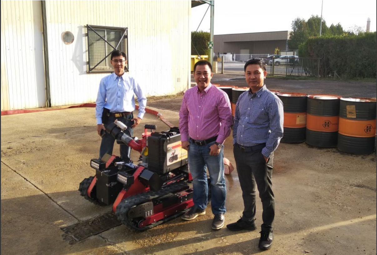
Our partners during the Jupiter® presentation

This was a great opportunity for the POK team to make sure its product offers meet its end customers technical needs and demands.